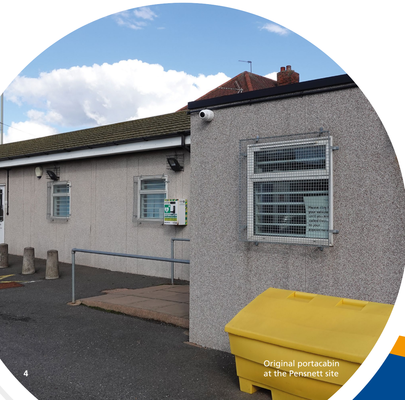
Original portacabin at the Pensnett site