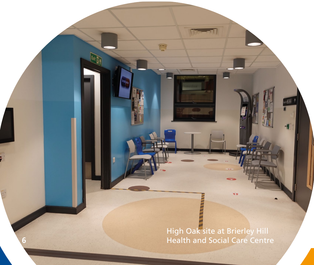
High Oak site at Brierley Hill Health and Social Care Centre