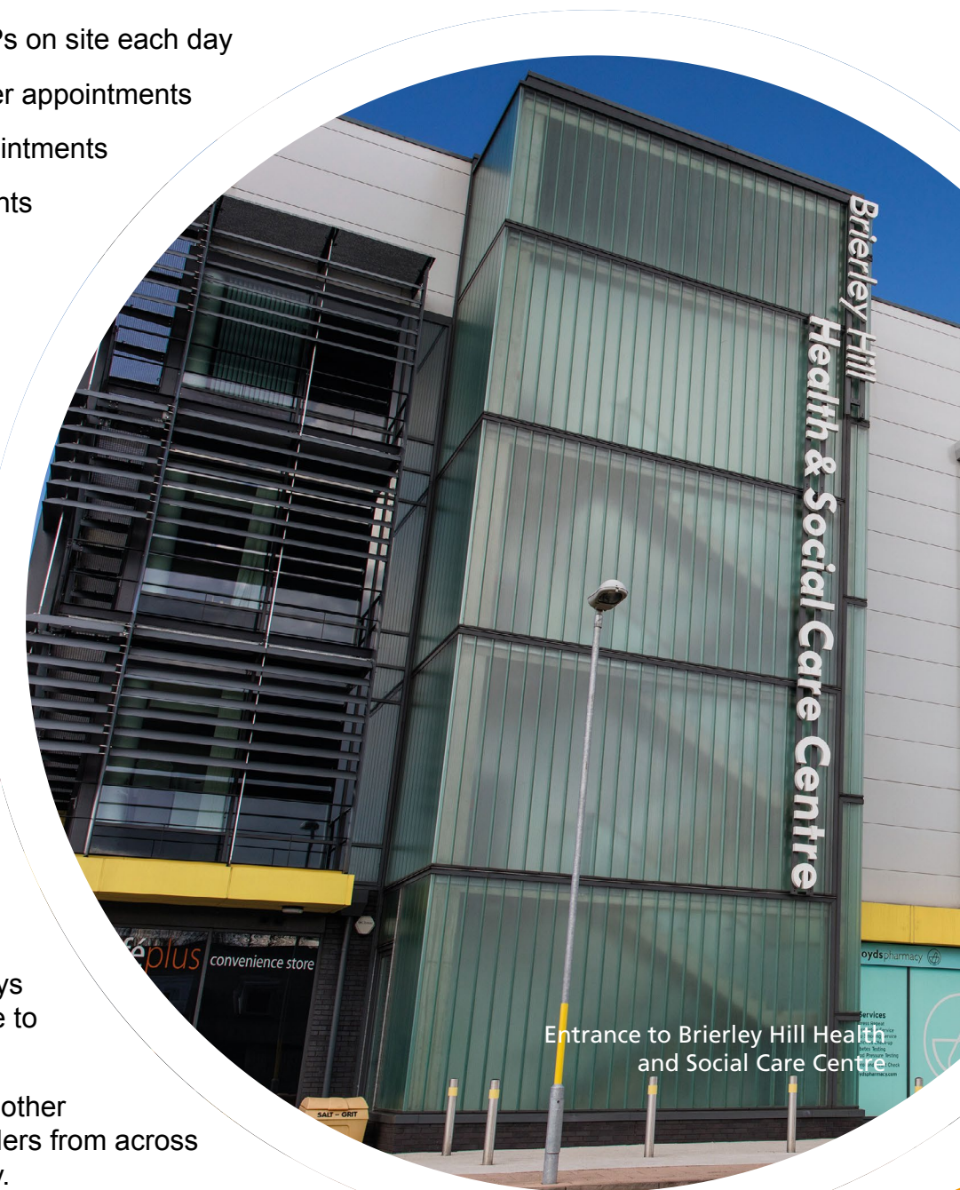
Entrance to Brierley Hill Health and Social Care Centre